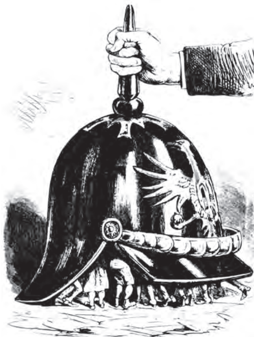
A cartoon published shortly after the Austro-Prussian War in 1866. The helmet represents Prussia while the people represent Germany.