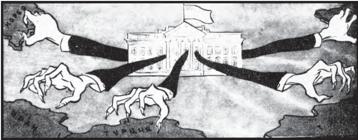
A Soviet cartoon published in 1950. The building represents the White House where the American President lives and works.

We are not at war. The Republic of Korea was unlawfully attacked by a bunch of bandits from North Korea. The United Nations held a meeting and asked the members to go to the relief of the Korean Republic, and the members of the United Nations are going to the relief of the Korean Republic, to suppress a bandit raid on the Republic of Korea. That is all there is to it.