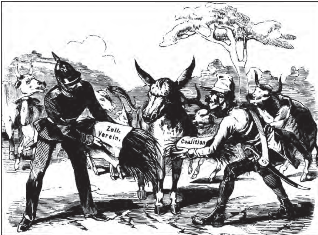
A cartoon from a German magazine published in 1852. The man on the left represents Prussia while the man on the right represents Austria. The animals represent those German states that did not belong to the Zollverein.