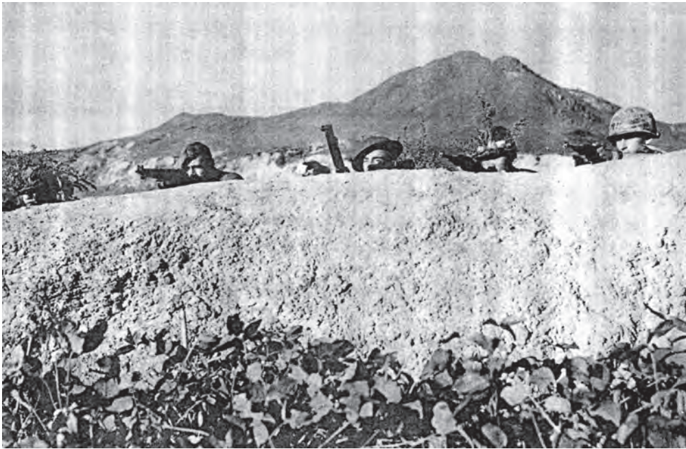
A photograph of UN soldiers in the Korean War. The soldiers include an American, an Australian, an Englishman, and two South Koreans.

Even in 1950 it was only the accident of the Soviet boycott that made the UN vote to intervene in Korea possible. The relatively small number of countries which then belonged to the UN, most of them sympathetic to the US, accepted American leadership in going to war for Korea. But only sixteen members provided military support. The way in which the war was fought made the presence of the UN flag seem to many to be a mockery. One British soldier said, 'Though we called ourselves the UN, there were so few of us. I felt very much an observer of an American show.' Other nations were less likely to rally to the UN flag again, because of the widespread view that this was used in Korea in the interests of the United States.